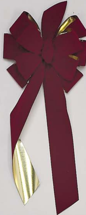
T. #40 10 Loop Burgundy Velvet Gold Back