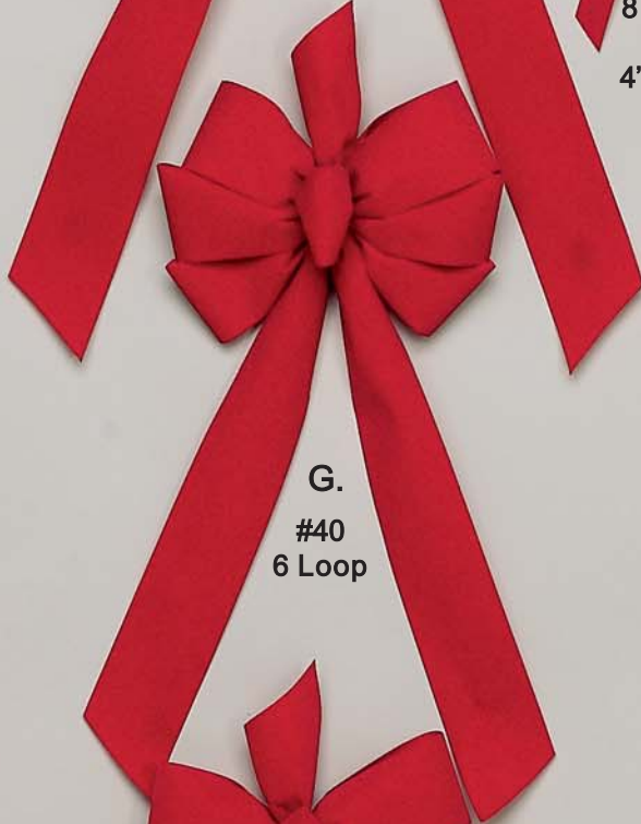
G. #40 6 Loop