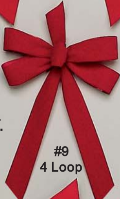
F. #9 4 Loop