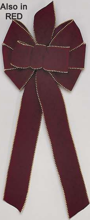
R. #40 8 Loop Burgundy Gold Beaded Also in RED