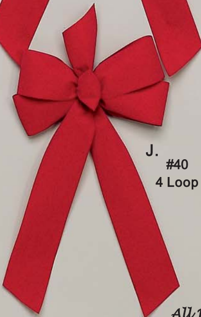
J. #40 4 Loop