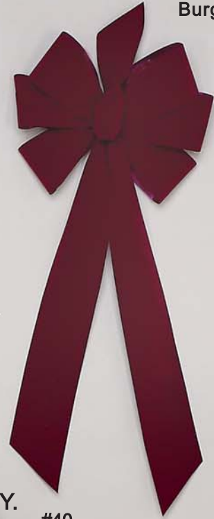
U. #40 6 Loop Burgundy