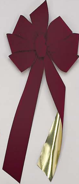
S. #40 6 Loop Burgundy Velvet Gold Back