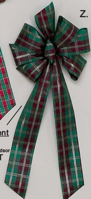
#40 6 Loop Windsor