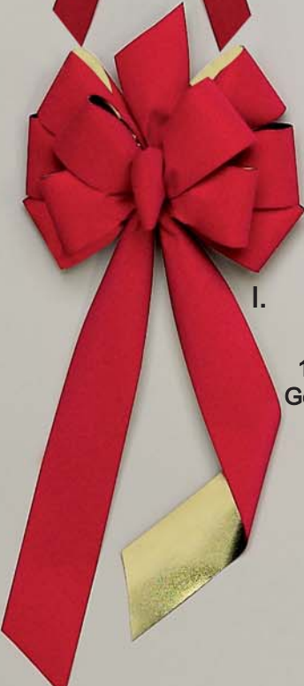
I. #40 10 Loop Gold Back