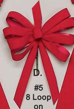
D. #5 8 Loop on 4" Pick