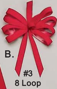
B. #3 8 Loop