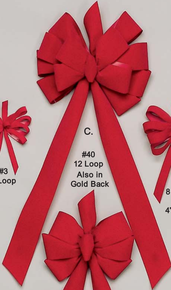
C. #40 12 Loop Also in Gold Back