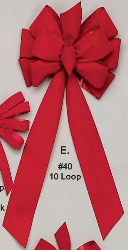
E. #40 10 Loop