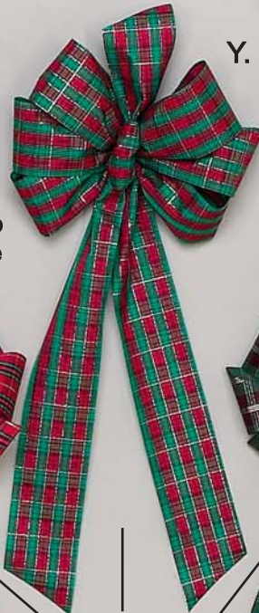
#40 6 Loop Kilt