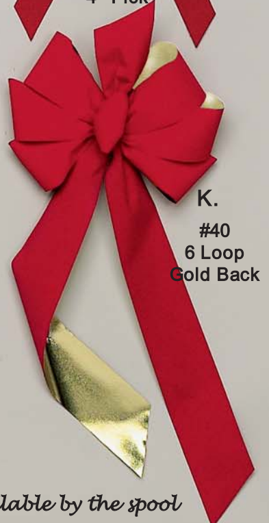
K. #40 6 Loop Gold Back