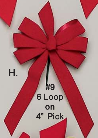
H. #9 6 Loop on 4" Pick